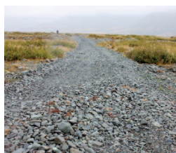
Rough Shingle (32%)