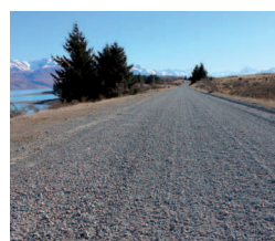
Gravel Road (48%)

The Alps 2 Ocean Cycle Trail starts at the White Horse Hill Campground, which is 2km north of Mt Cook Village. From here, a 7.2km off-road trail takes you to Mount Cook Airport, where riders will need to make a short helicopter flight across the Tasman River to Tasman Point. Travelling in a helicopter across a glacially-fed braided stream with New Zealand's highest mountain in view is a must do. The helicopter can carry up to 6 passengers at a time (depending on weight limits).