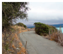
Smooth Shingle (20%)