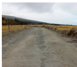
Dirt Track (less than 1%)